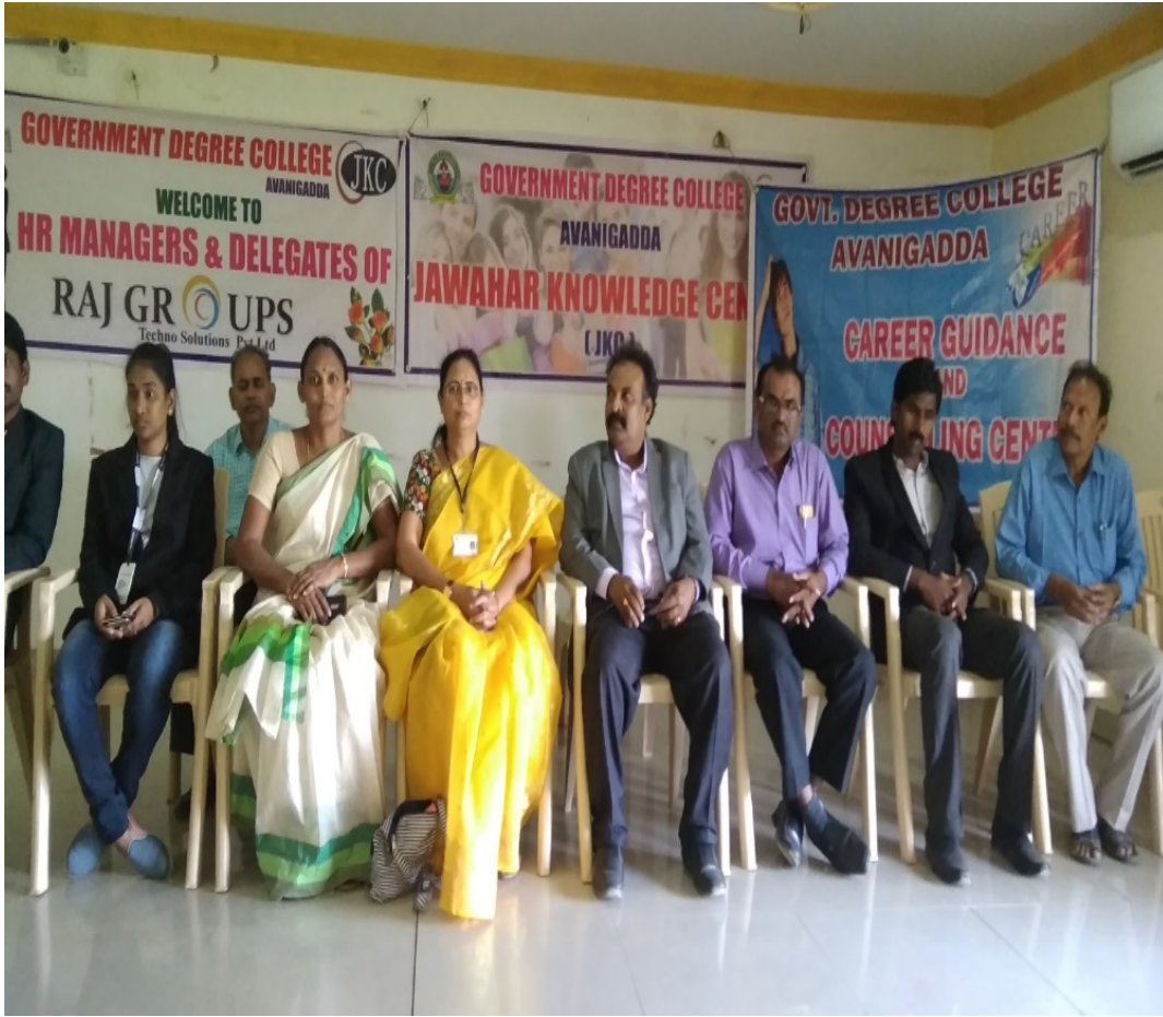
Meeting With Staff And Participants