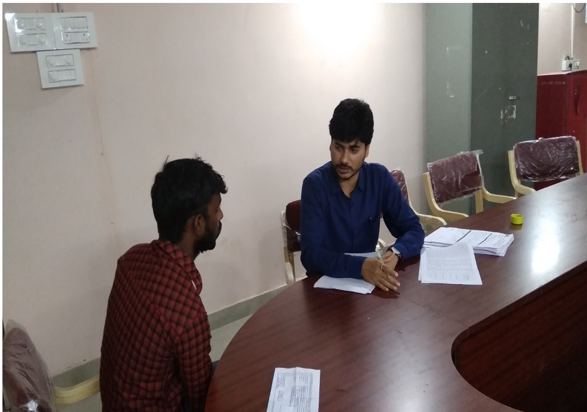
Students participation in Interviews